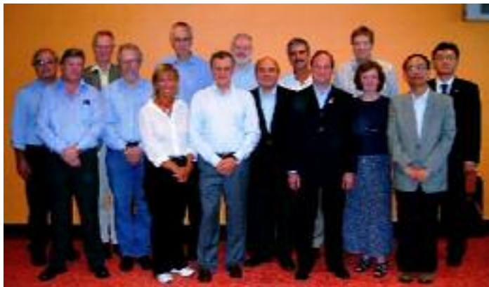
Delegates at the meeting in Leiden.

included in the draft ISCO listing. This draft is currently being voted on by national employee organisations and/or government organisations and you are encouraged to lobby within your own country for acceptance of this proposal.